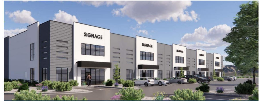
BUILDING 1 100,000 SF ● MULTI-TENANT FLEX