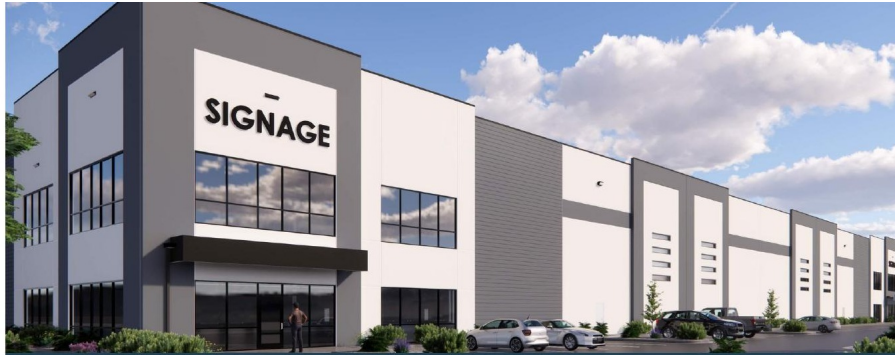
BUILDING 1 100,000 SF ● SINGLE-TENANT CAPABLE

Two spec buildings totaling 15 acres at the northwest corner of the master plan, designed for a mix of single-tenant users and flexible multi-tenant configurations. Modern industrial design language with insulated metal panels, generous glazing on office frontage, and ESFR-ready warehouse interiors. Suites available from 7,000 SF to 100,000 SF.