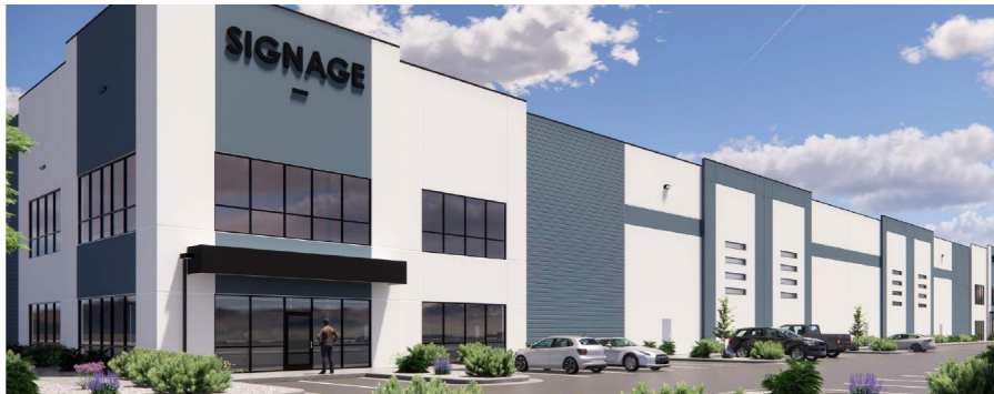
BUILDING 2 100,000 SF ● SINGLE-TENANT CAPABLE