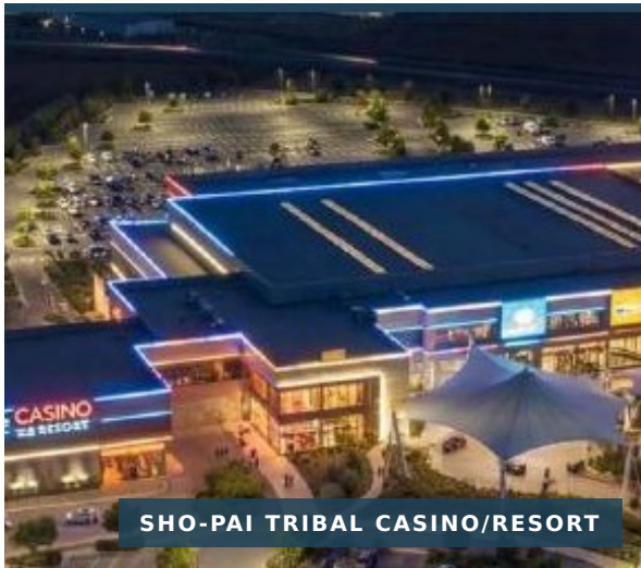
SHO-PAI TRIBAL CASINO/RESORT

Three major developments anchor the corridor and reinforce demand at Peregrine's interchange.