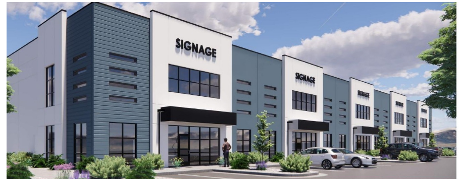
BUILDING 2 100,000 SF ● MULTI-TENANT FLEX