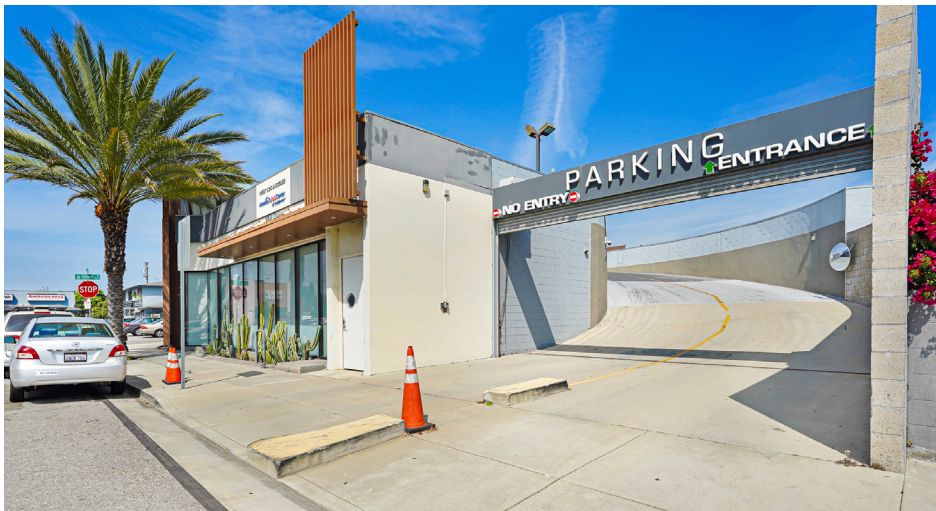
Entrance to rooftop parking on Vera Way