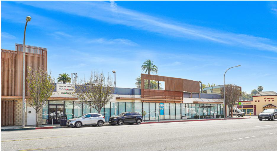
Over 100' of frontage on Sepulveda Blvd.

High identity building on busy Sepulveda Blvd.