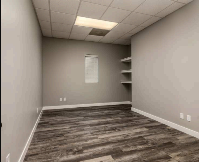
OFFICE W/ SHELVING