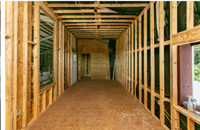
UPSTAIRS MEZZANINE ABOVE OFFICE