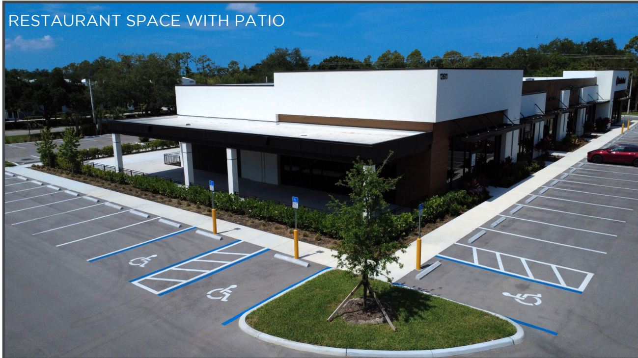
RESTAURANT SPACE WITH PATIO