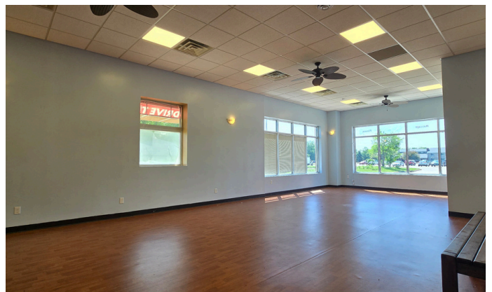
Open Work / Retail Area