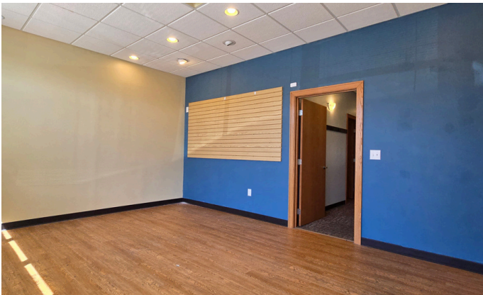
Front Entrance / Reception Area