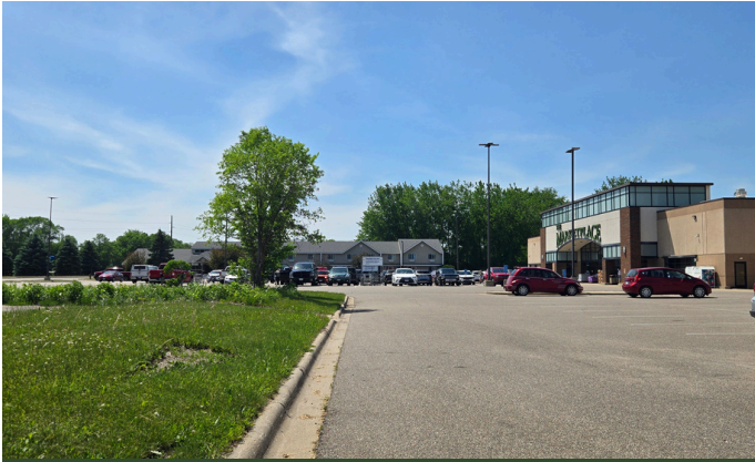
Exterior - Anchored by the Marketplace