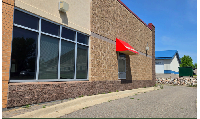
Former Drive-Through Window