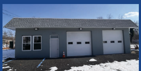
1348 GLASSBORO ROAD