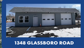
1348 GLASSBORO ROAD