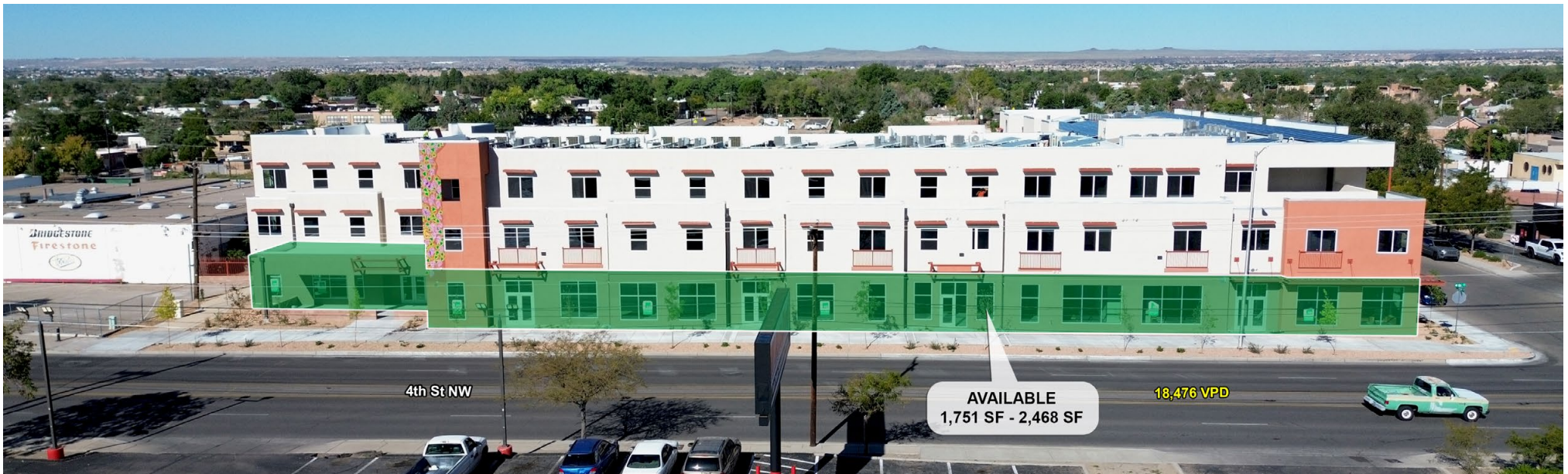
Construction Progress as of September 2025