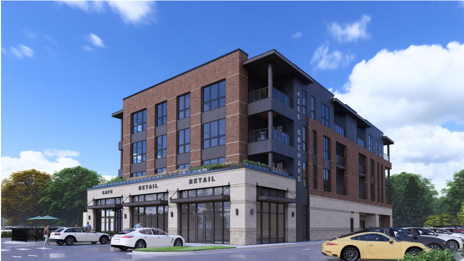
View Looking Southwest