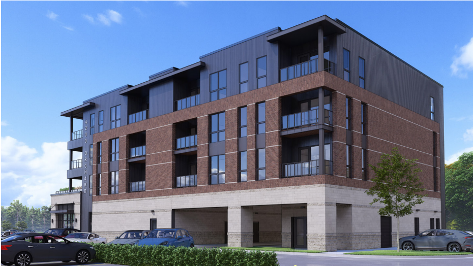
View Looking Southeast