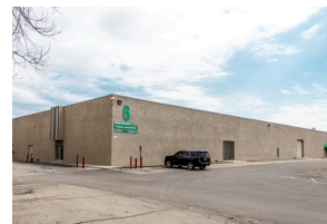
1030 FREEWAY DRIVE N., COLUMBUS, OH 43229