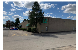
944 FREEWAY DRIVE N., COLUMBUS, OH 43229