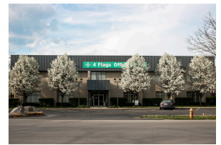
800 FREEWAY DRIVE N., SUITE 106 COLUMBUS, OH 43229