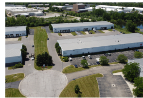
6766 COMMERCE COURT DRIVE, BLACKLICK, OH 43004