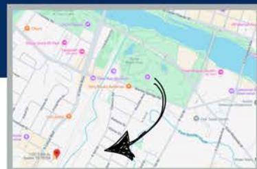
▶ Great Central Location