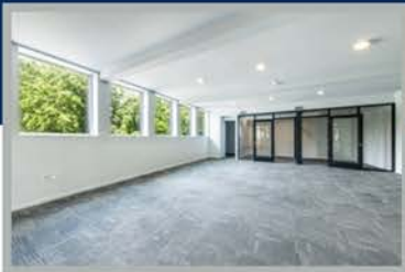
▶ Private Offices