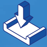
Floor Loading 50 Kn/M 2