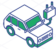
Electric Vehicle Charging Points

Bridge Point Croydon has been designed with a sustainable future in mind featuring best in class ESG credentials reducing occupational costs and catering to the requirements of modern day occupation, safeguarding against the requirements of tomorrow.