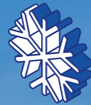
Comfort Heating / Cooling