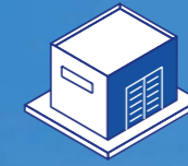
5 Dock & 2 Level Loading Doors