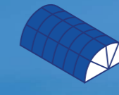
Barrel Vaulted Roof