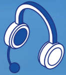
Office - Cat-A Fit Out