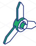
Air Source Heat Pumps