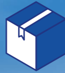
Classes Eg(ii), Eg(iii), B2 And B8