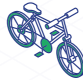
Secure Cycle Parking