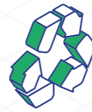
EPC A+ Rating