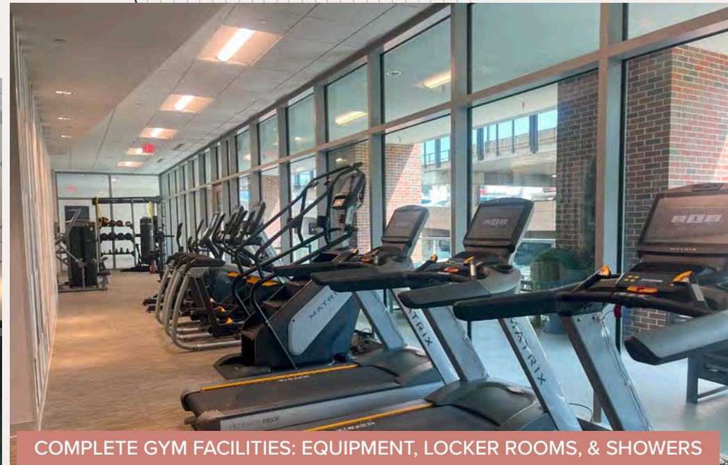
COMPLETE GYM FACILITIES: EQUIPMENT, LOCKER ROOMS, & SHOWERS