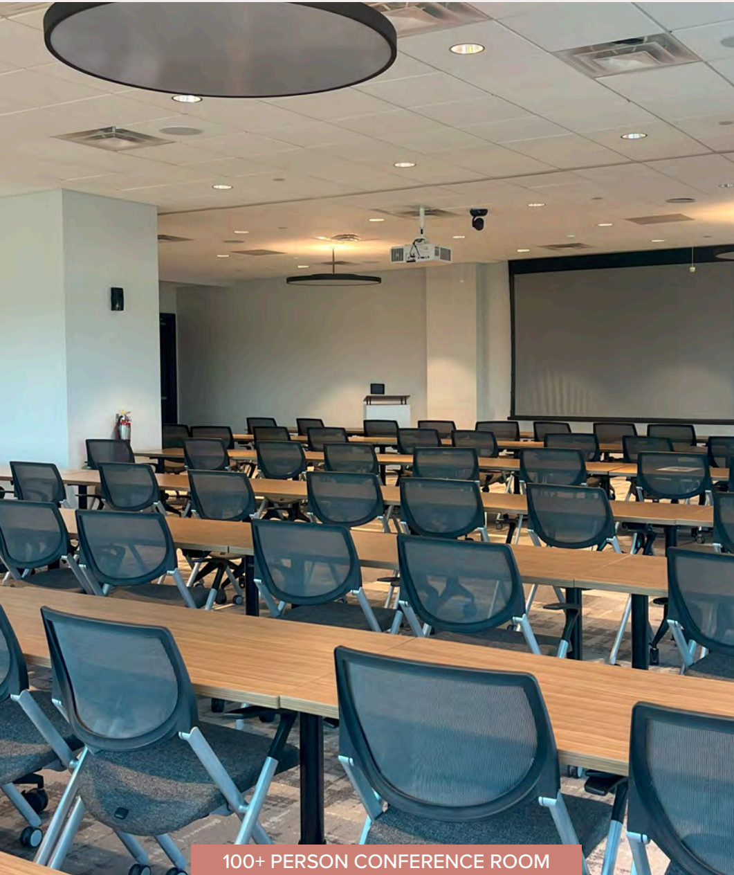
100+ PERSON CONFERENCE ROOM