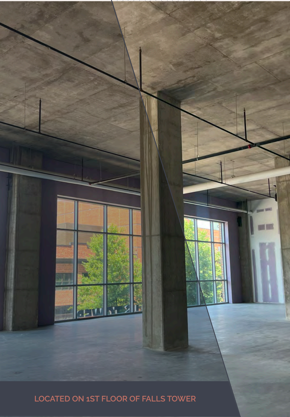
LOCATED ON 1ST FLOOR OF FALLS TOWER