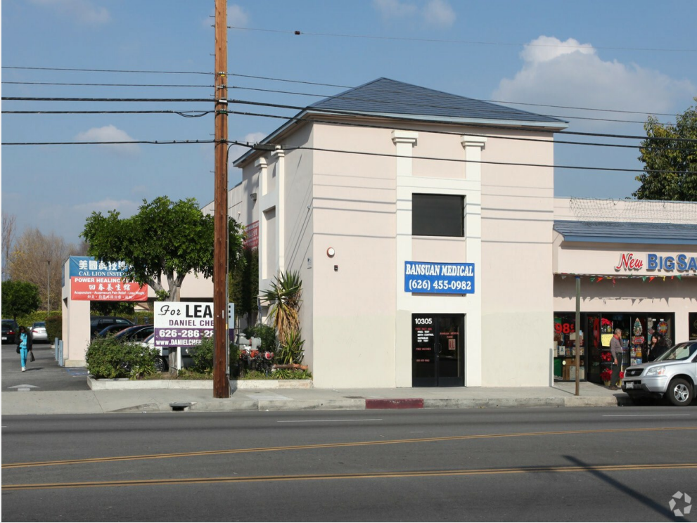
10303-10309 Garvey Ave