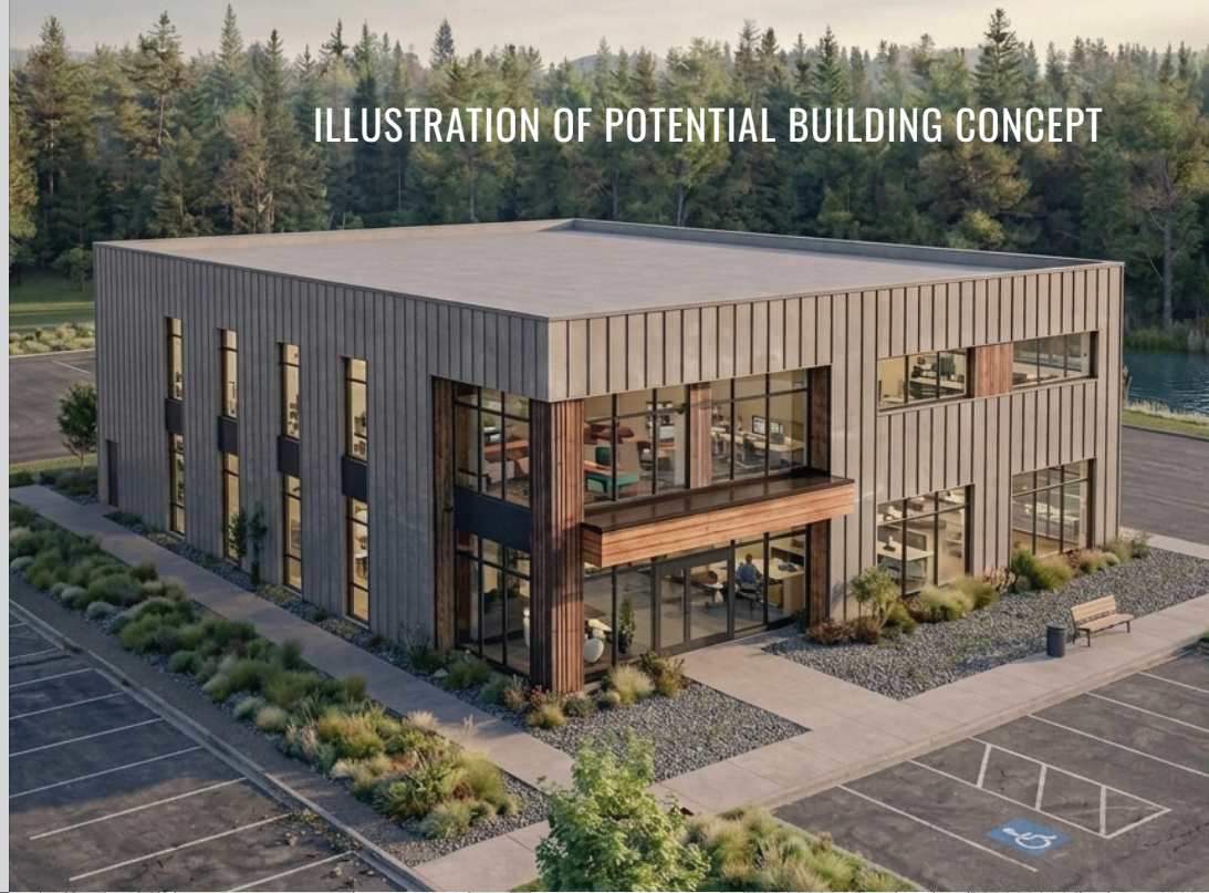
ILLUSTRATION OF POTENTIAL BUILDING CONCEPT