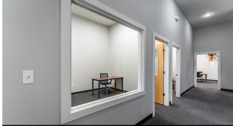
Suite 131 Hallway