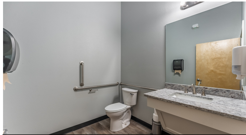
Suite 131 Restroom