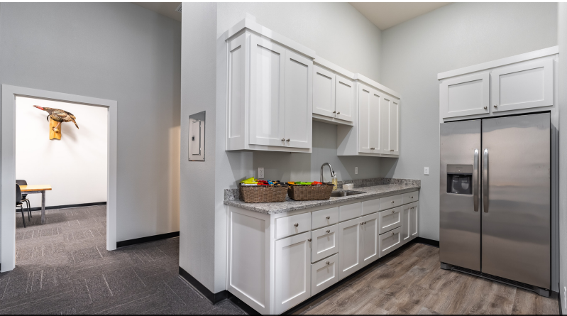
Suite 131 Kitchenette