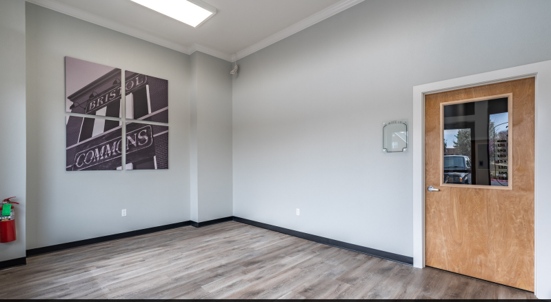
Common Area/Suite 131 Entrance