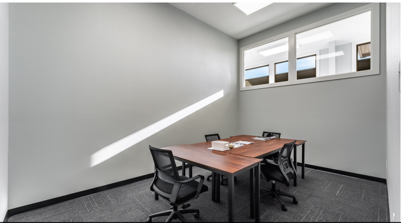
Suite 131 Office