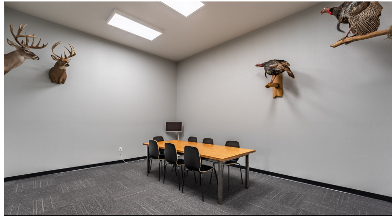
Suite 131 Conference Room