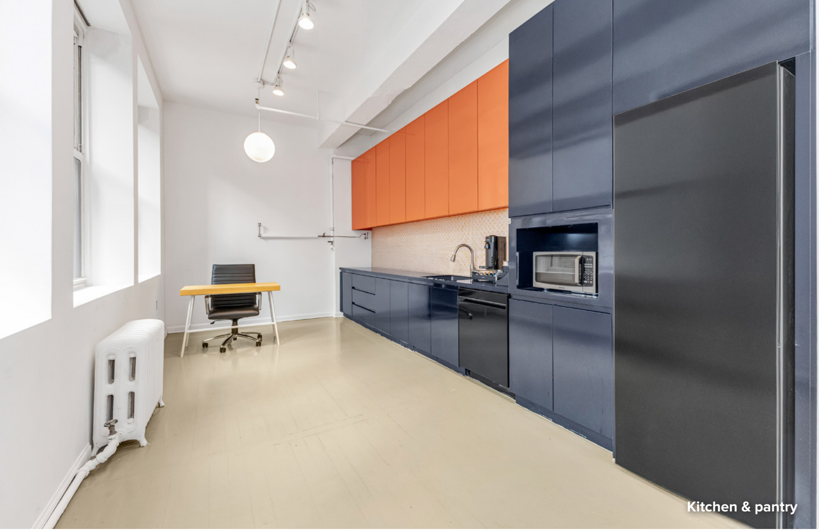
Kitchen & pantry