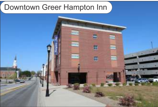
Downtown Greer Hampton Inn