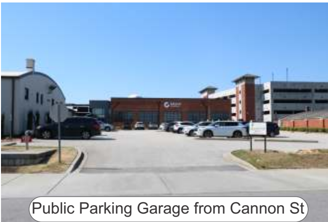
Public Parking Garage from Cannon St