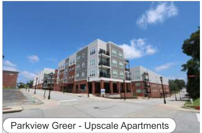
Parkview Greer - Upscale Apartments