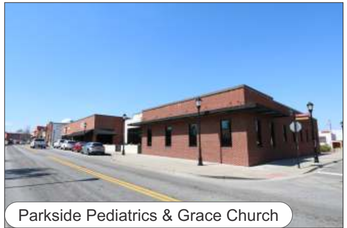
Parkside Pediatrics & Grace Church