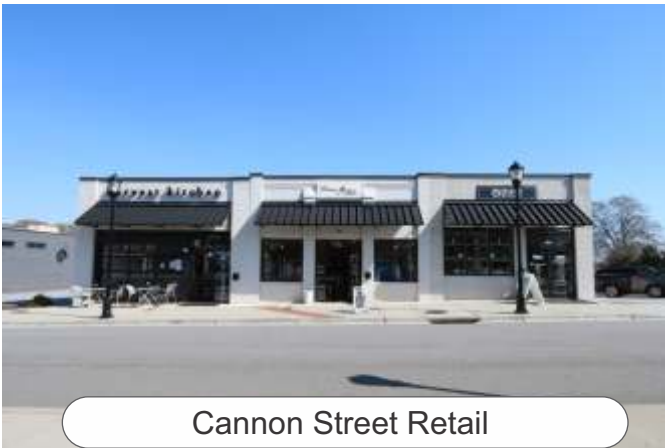
Cannon Street Retail