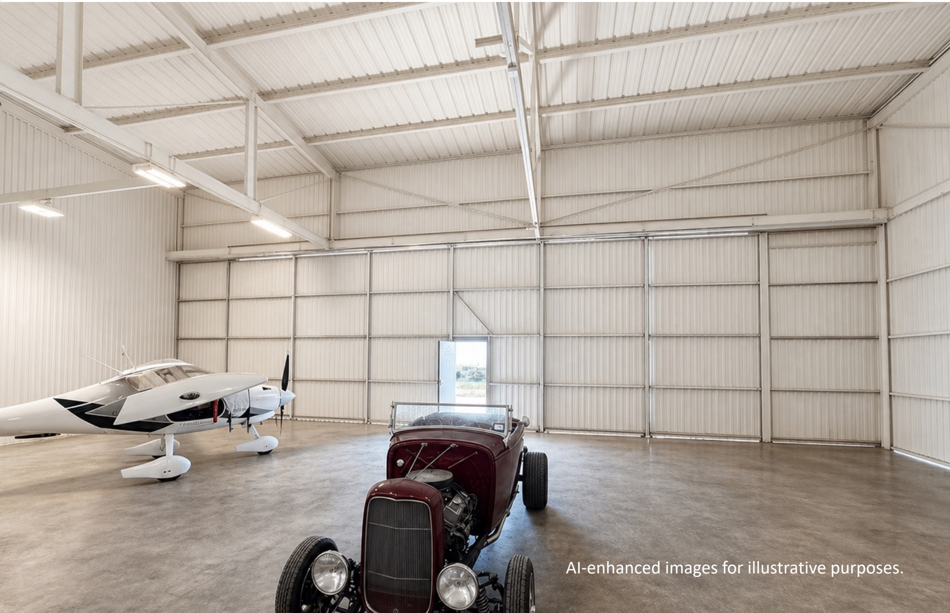
AI-enhanced images for illustrative purposes.