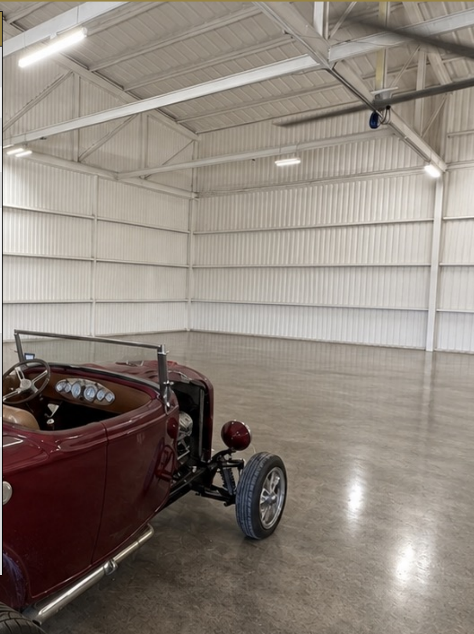
AI-enhanced images for illustrative purposes.