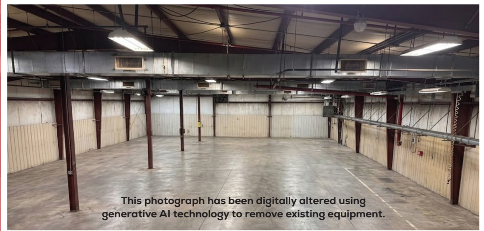
This photograph has been digitally altered using generative AI technology to remove existing equipment.