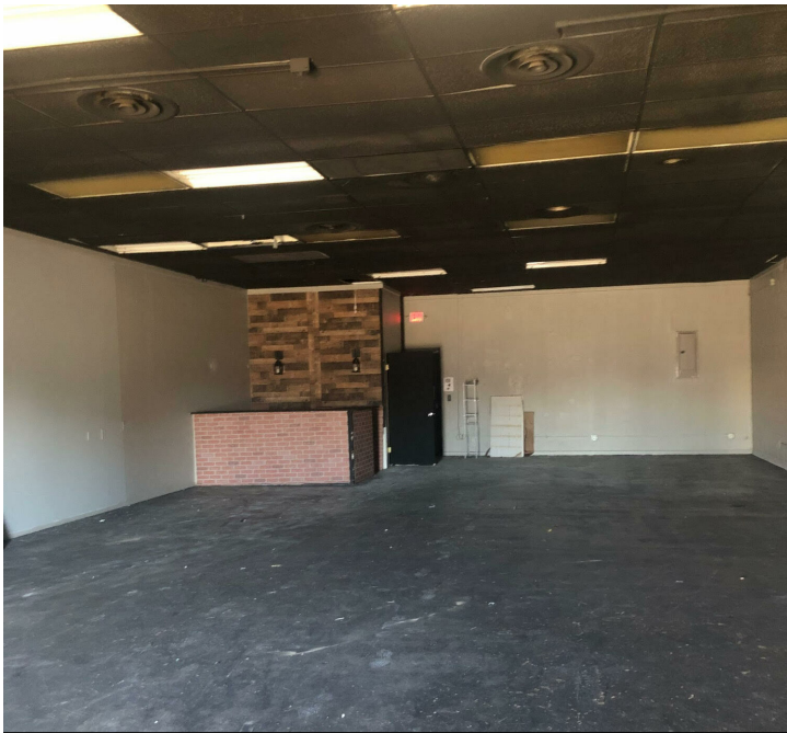
341-343 Hastings: 3,000 square feet

GAUT·WHITTENBURG·EMERSON Commercial Real Estate CCIM SIOR