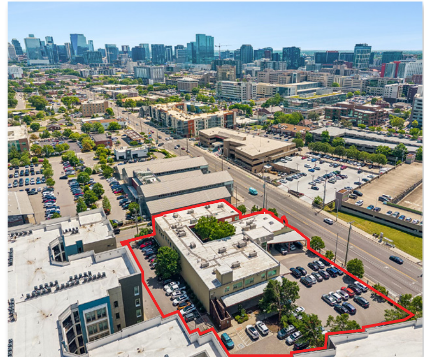
POTENTIAL MULTIFAMILY REDEVELOPMENT OPTION

Offered well below replacement cost and free & clear of existing financing