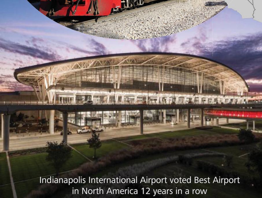
Indianapolis International Airport voted Best Airport in North America 12 years in a row