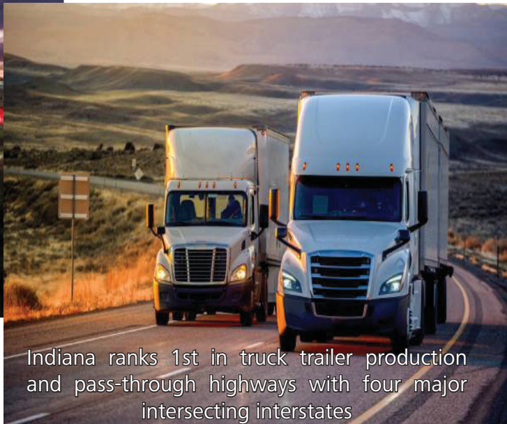
Indiana ranks 1st in truck trailer production and pass-through highways with four major intersecting interstates