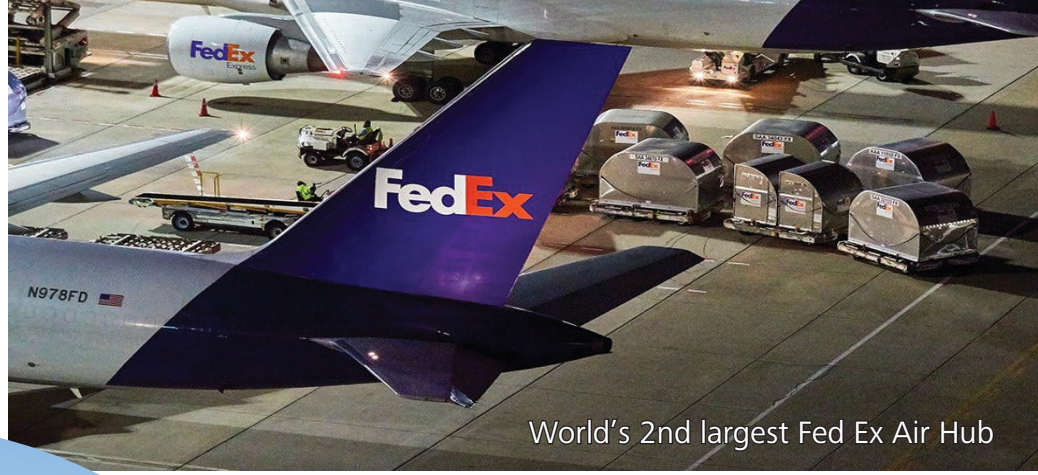
World's 2nd largest Fed Ex Air Hub

Indianapolis: Centrally located with award-winning infrastructure for maximum logistical benefit