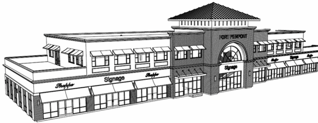
1 PERSPECTIVE FRONT SCALE: SHEET A-2.0