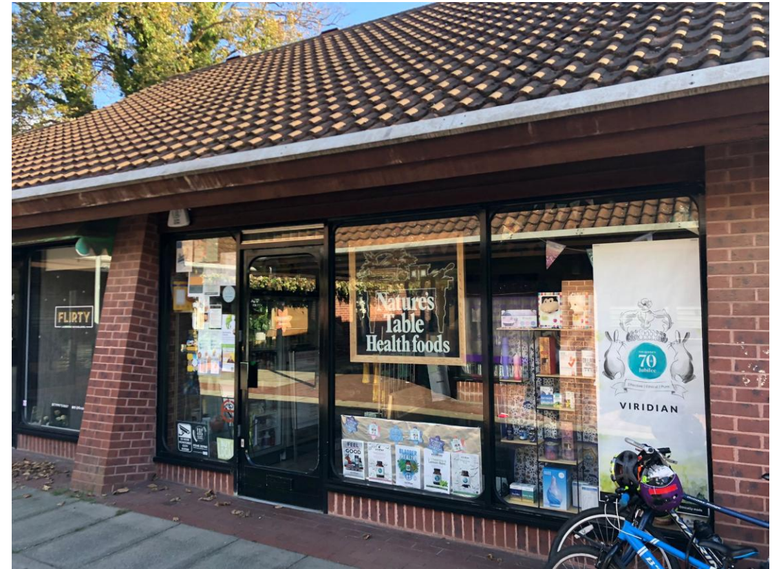
Unit 8 The Walk: Organic Food Supplements Ground Floor: 45 sq m (485 sq ft) Open plan retail, Storage, Kitchenette