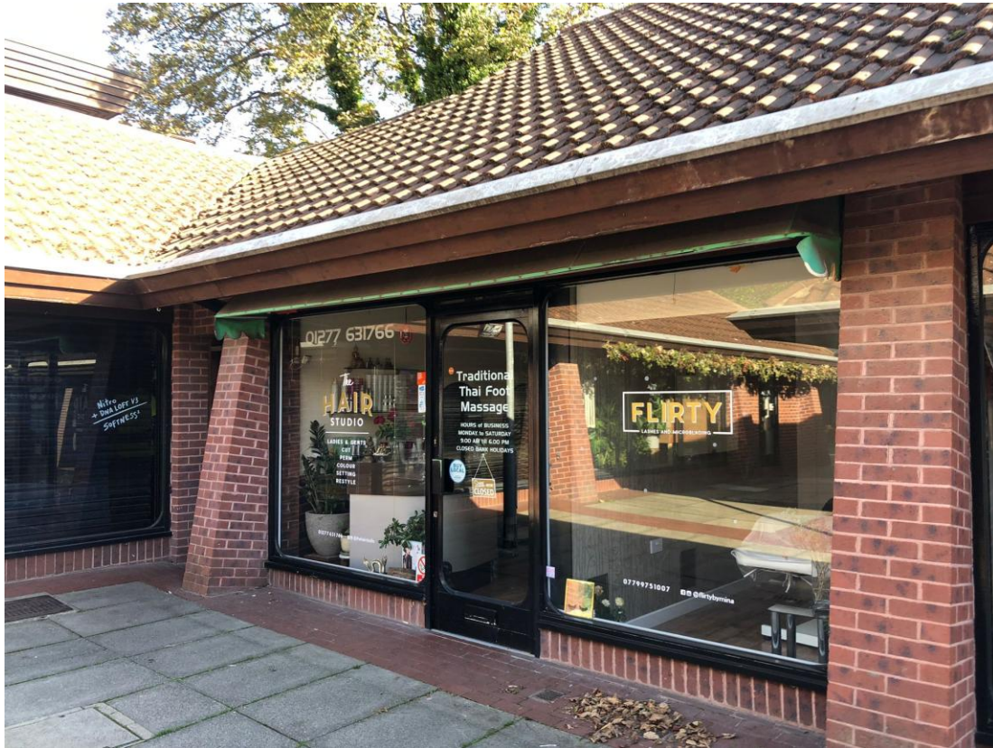
Unit 7 The Walk: Hair Salon Ground Floor: 44 sq m (474 sq ft) Open plan retail, Storage, Kitchenette