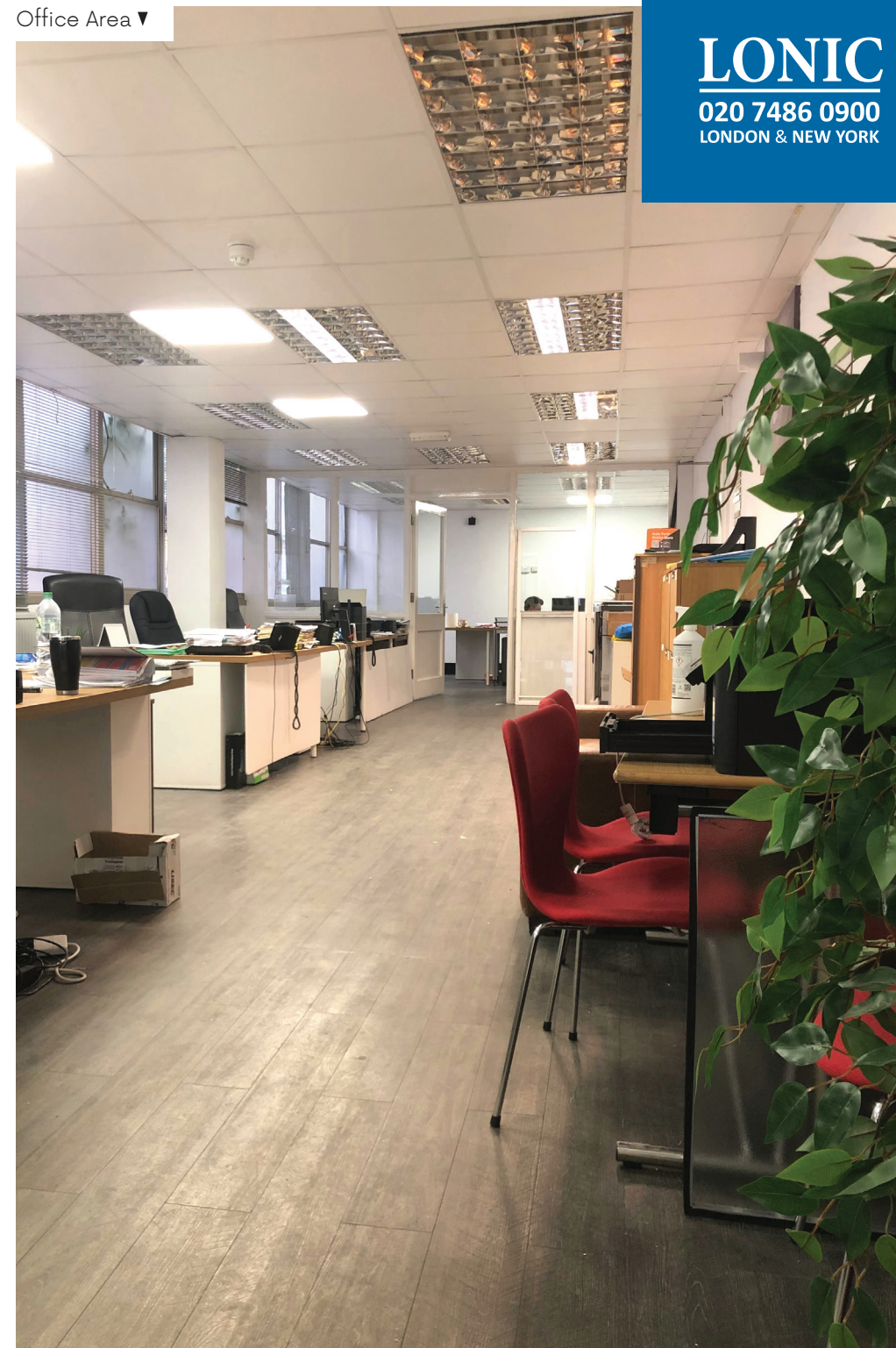
Office Area ▼