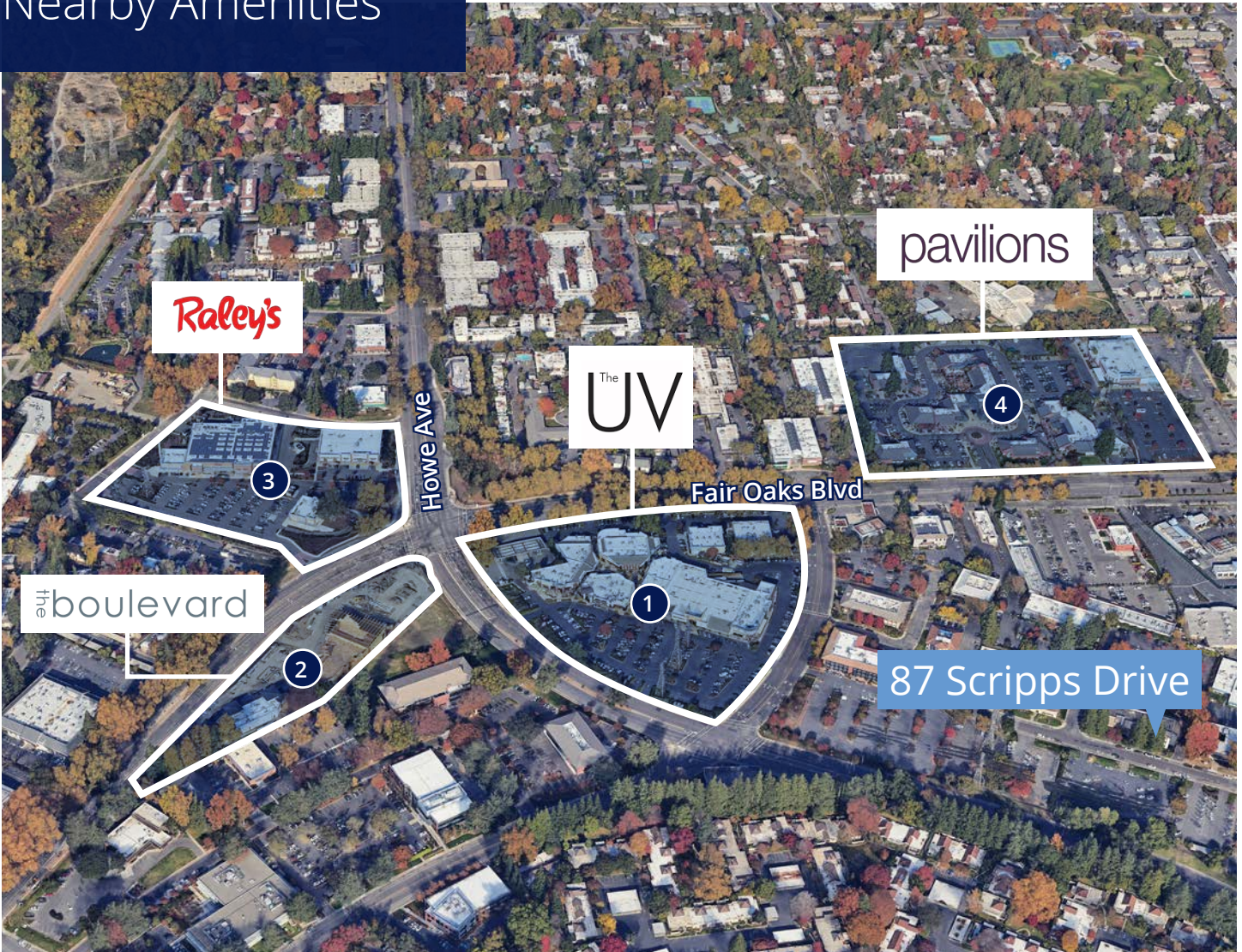
1 The UV Shopping Center