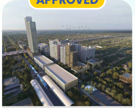
Swerdlow Group Project