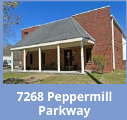
7268 Peppermill Parkway