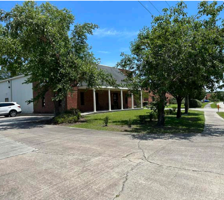
Avison Young | 7268 Peppermill Parkway