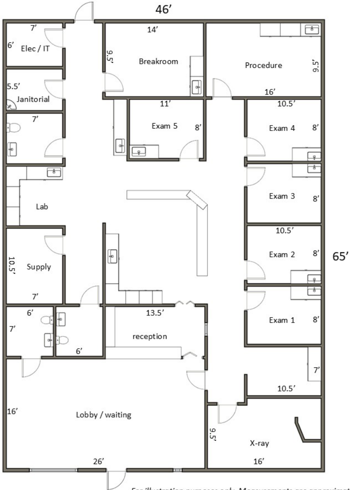
For illustration purposes only. Measurements are approximate.

Colliers | Hot Springs 835 Central Ave, Ste. 200 Hot Springs, AR 71901 P: +1 501 623 2200