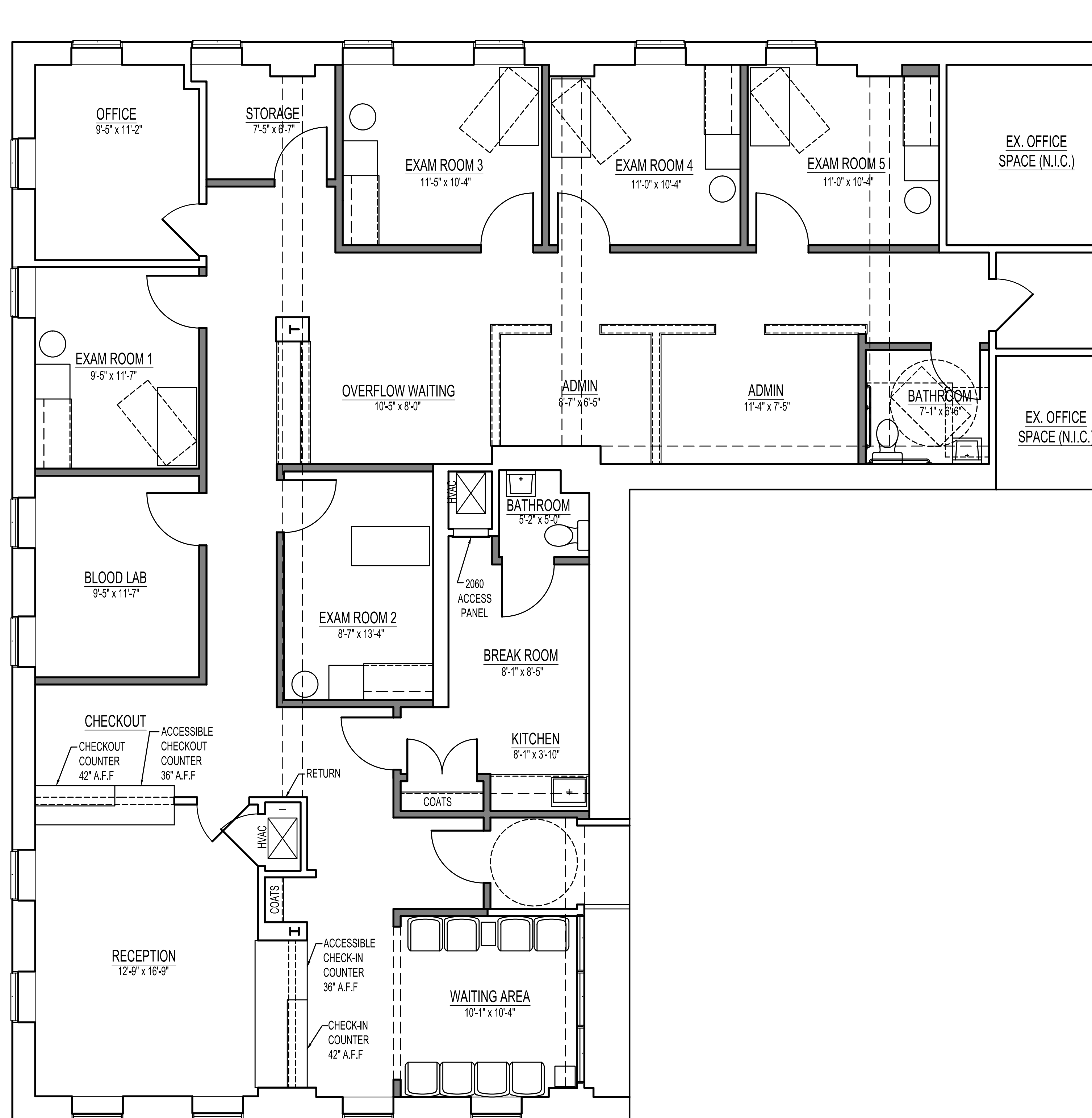
1 FLOOR PLAN SCALE: 1/4" = 1'-0" (22x34) SCALE: 1/8" = 1'-0" (11x17)