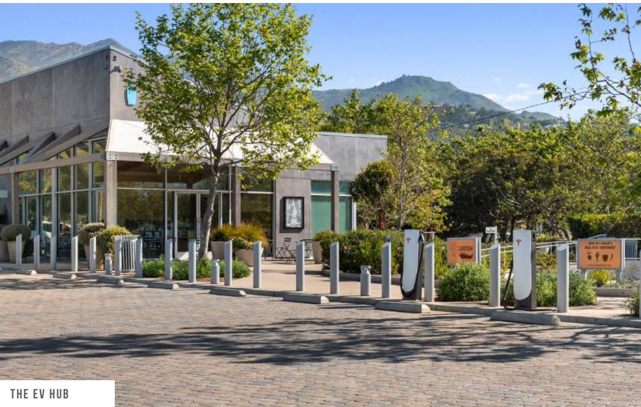
THE EV HUB