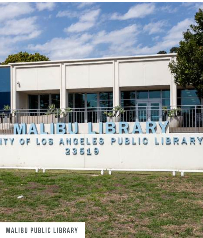
MALIBU PUBLIC LIBRARY