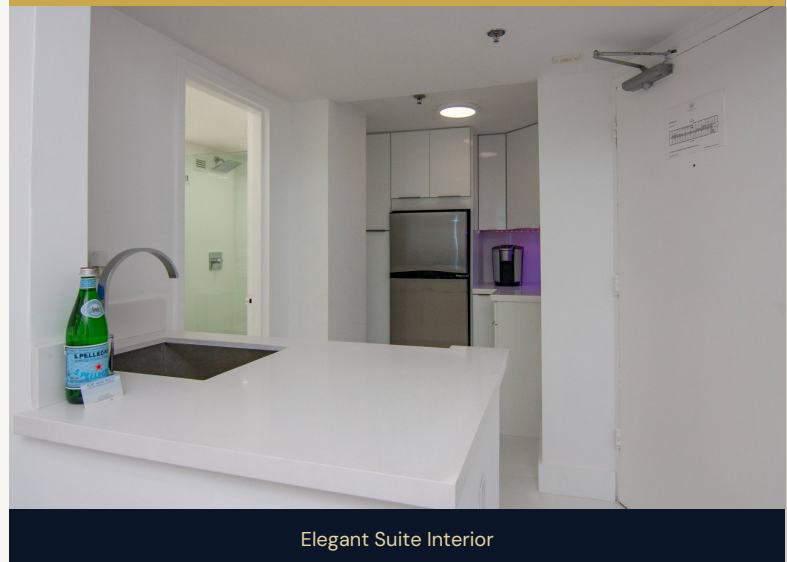
Elegant Suite Interior