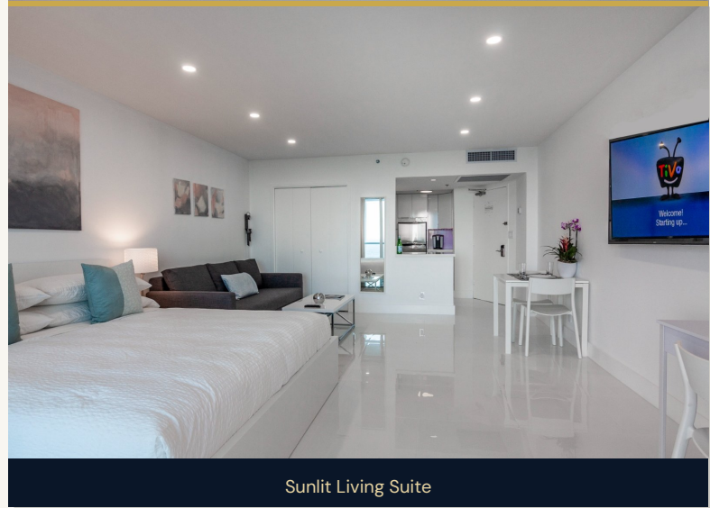
Sunlit Living Suite