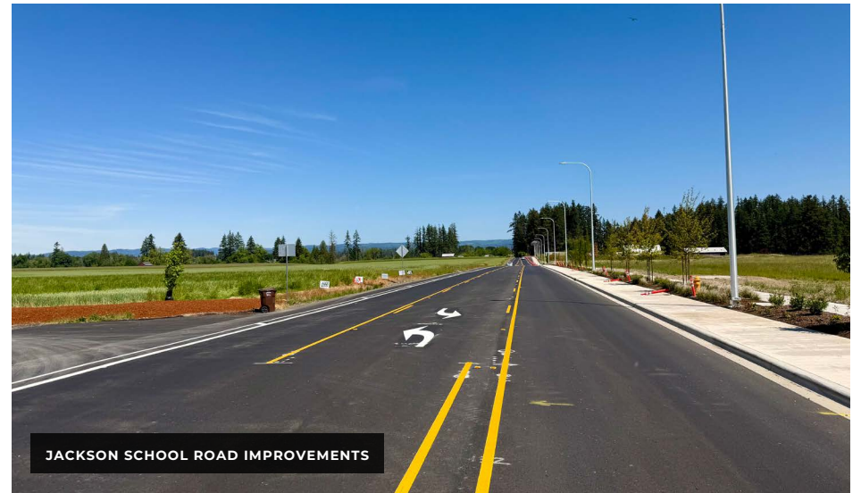
JACKSON SCHOOL ROAD IMPROVEMENTS