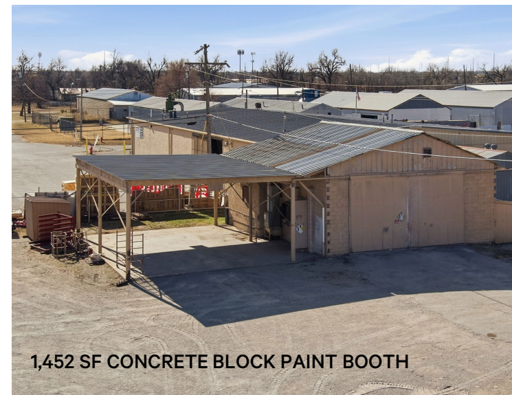
1,452 SF CONCRETE BLOCK PAINT BOOTH