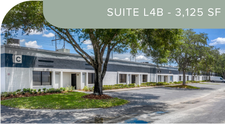
SUITE L4B - 3,125 SF

14140 MCCORMICK DRIVE, SUITE L4B | TAMPA, FL 33626