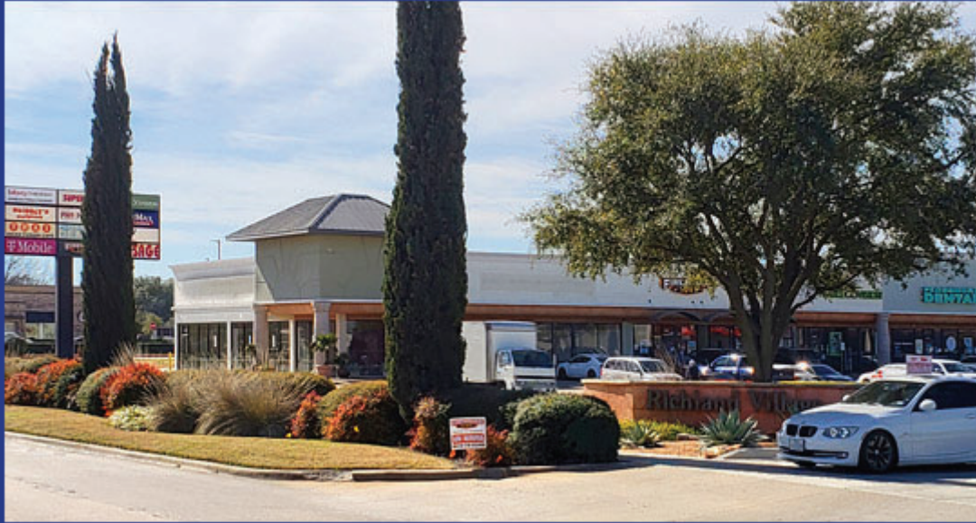
Belt Line Road and Plano Road in Richardson, Texas