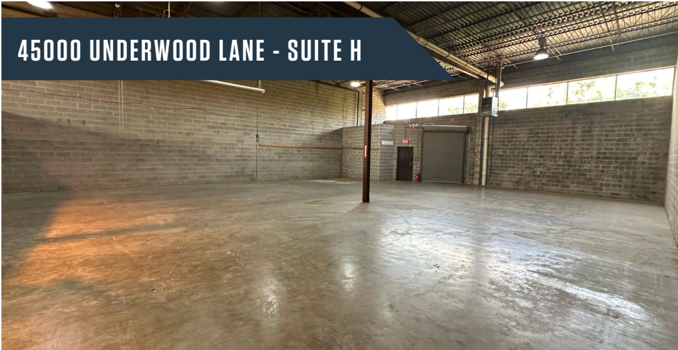
45000 UNDERWOOD LANE - SUITE H

45000-45064 Underwood Ln, Sterling, VA 20166