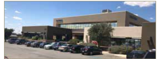
NEWLY RENOVATED BUILDING