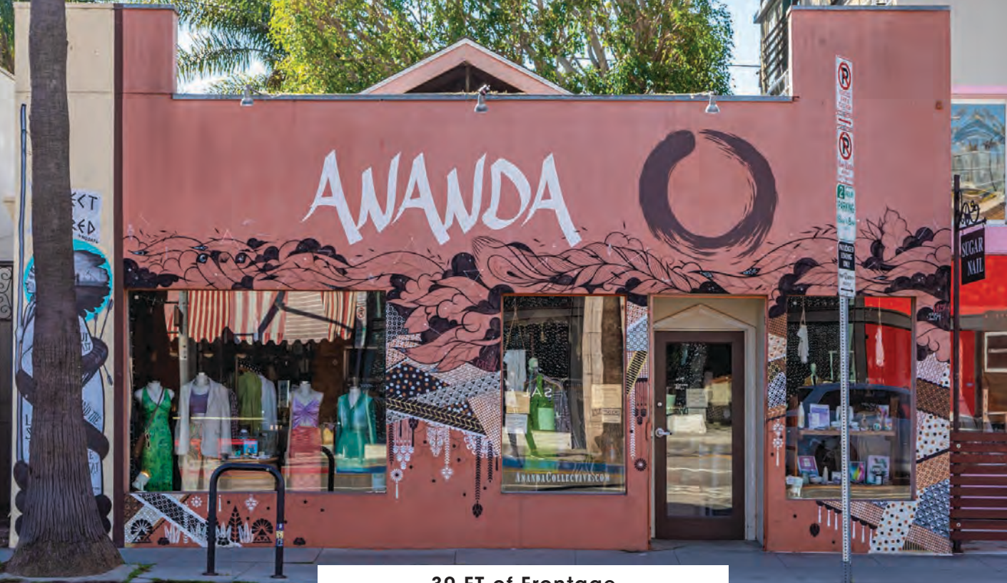
30 FT of Frontage