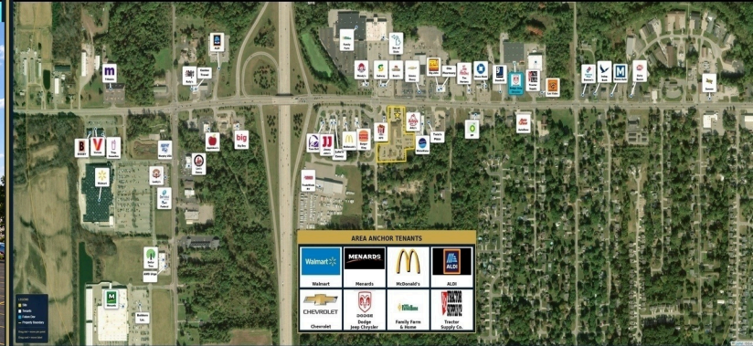
SURROUNDING RETAIL TENANTS