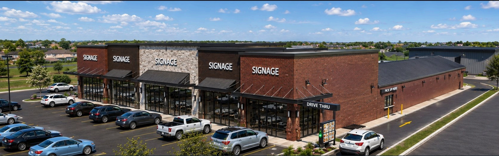
STREET LEVEL VIEW — MAIN BUILDING

Drive-Thru Opportunities · Build-to-Suit Retail · Automotive & Warehouse Space 75,000 VPD Interstate Exposure · 22,783+ SF Available · NNN · Call for Pricing · Mid 2027