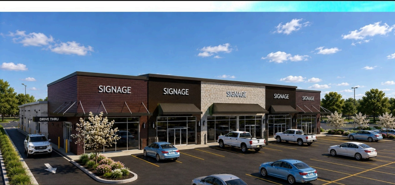
AERIAL VIEW — STRIP CENTER