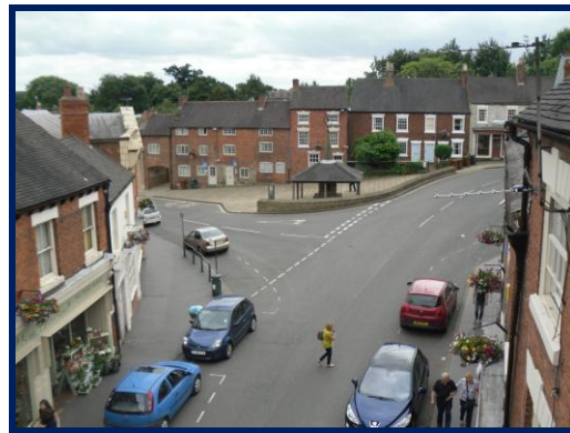
39 Market Place, Melbourn, Derbyshire, DE73 8DS

NOT TO SCALE FOR IDENTIFICATION PURPOSES ONLY