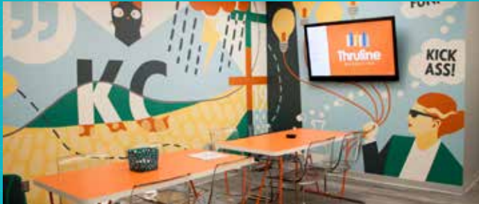
ThruLine Marketing | Voted One of the Coolest Office Spaces in KC

New Ownership with Capital Improvement Plans