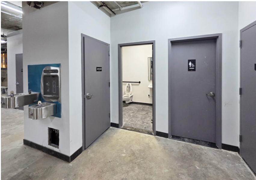
Private ADA Accessible Restrooms