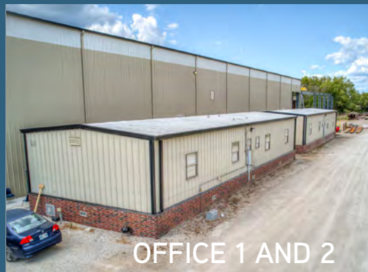
OFFICE 1 AND 2