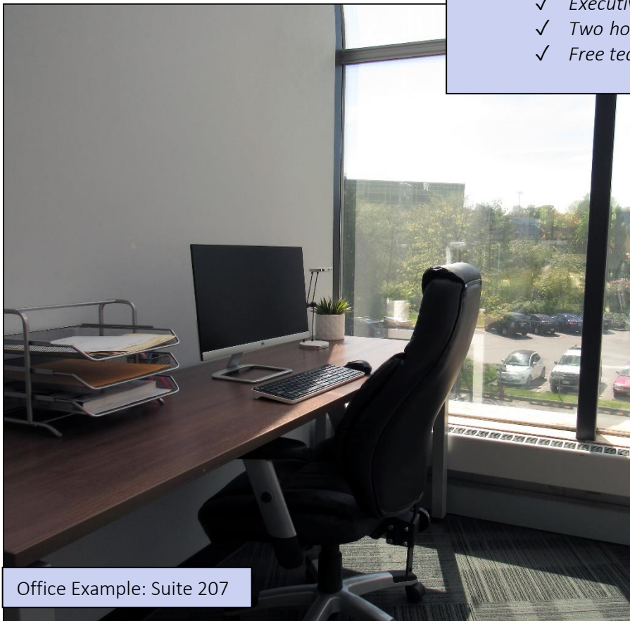
Office Example: Suite 207