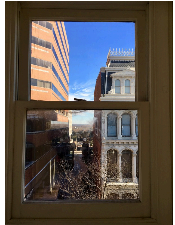
Apartments' view Market St. facing East.