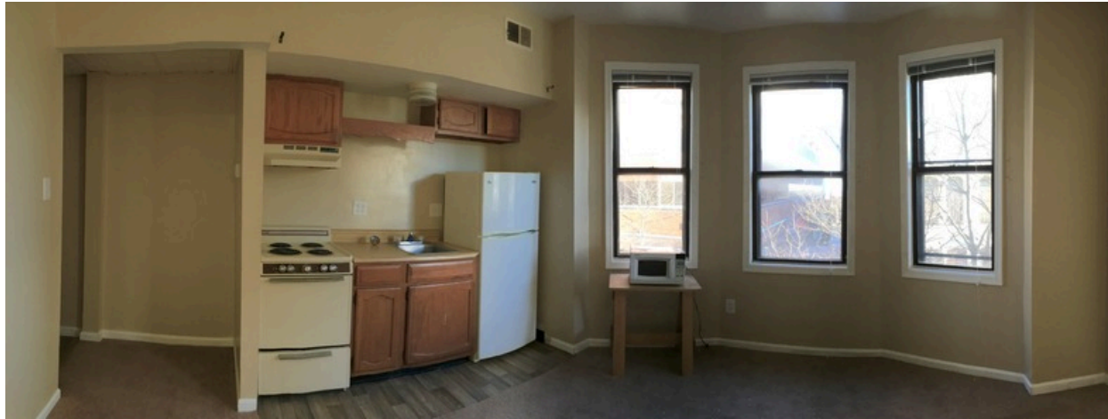
Fourth floor apartment interior.