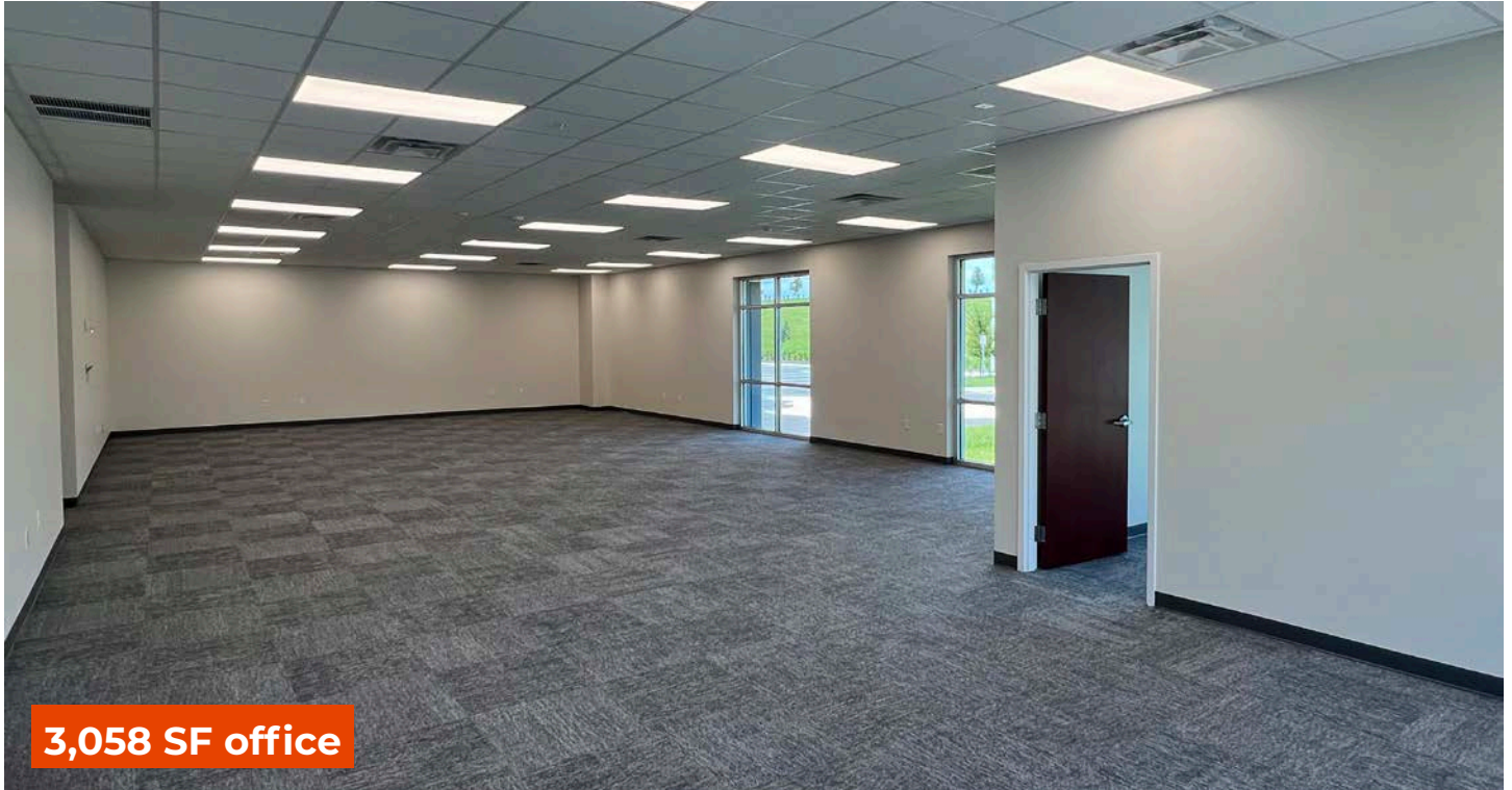
3,058 SF office