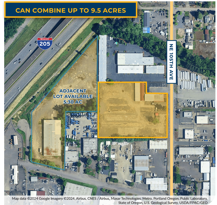
Map data ©2024 Google Imagery ©2024, Airbus, CNES / Airbus, Maxar Technologies, Metro, Portland Oregon, Public Laboratory, State of Oregon, U.S. Geological Survey, USDA/FPAC/GEO