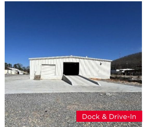
Dock & Drive-In